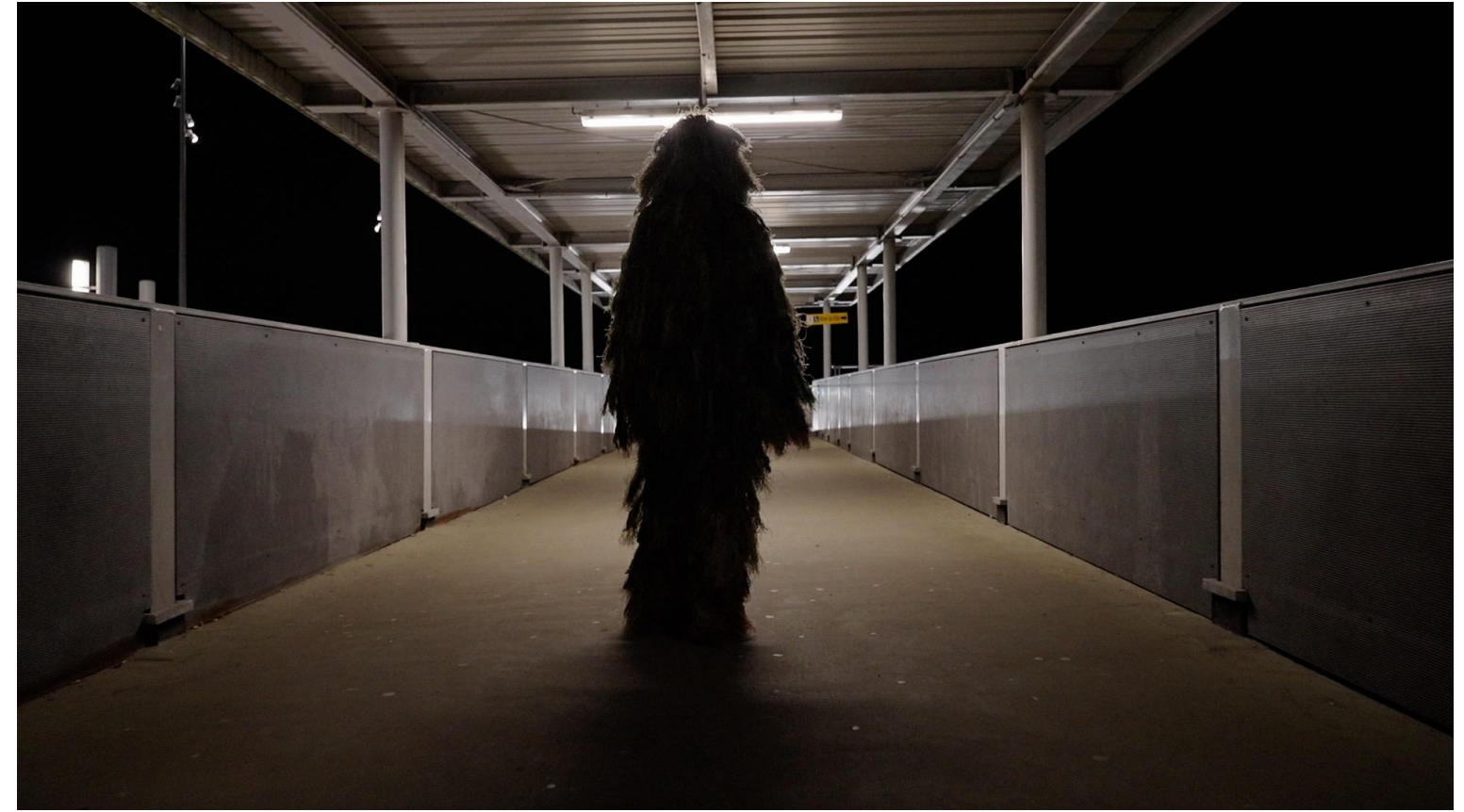
THEBADWEEDS TRANSMEDIA FICTION