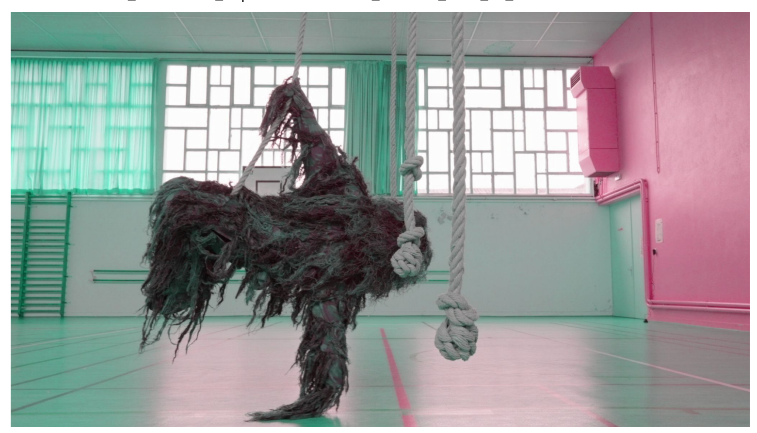
THEBADWEEDS _Audiovisual_Clips and Web Series_Creation_2023_24_25